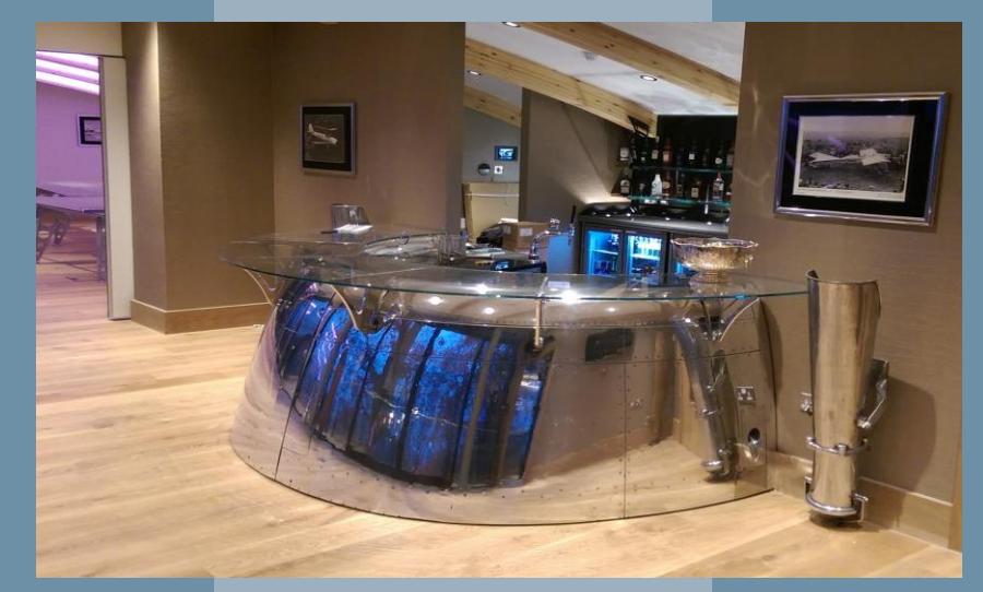
Bowcliffe Hall, Wetherby- Customer Facing