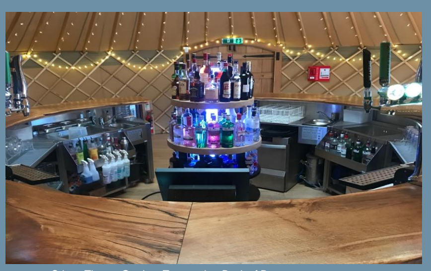
Cripps Thorpe Garden, Tamworth – Back of Bar