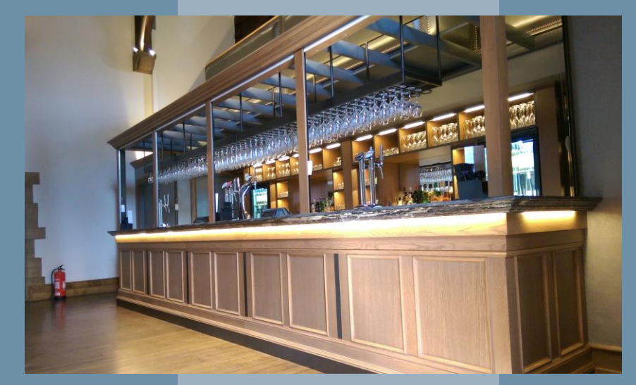
Alnwick Castle, Alnwick – Customer Facing