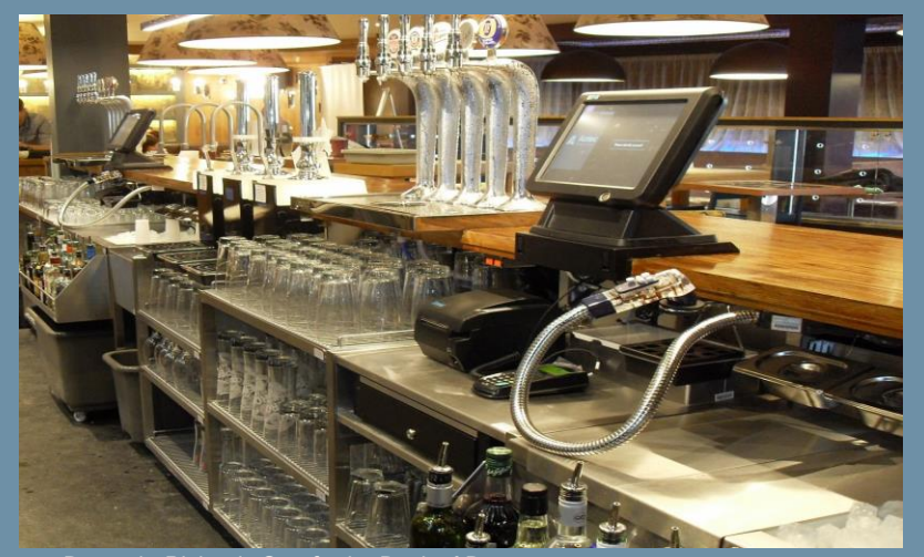
Baroosh, Bishop's Stortford – Back of Bar