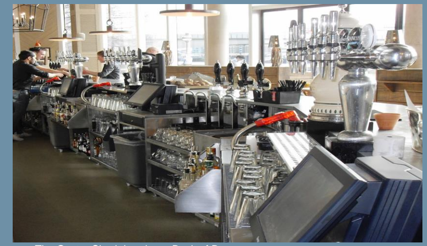
The Oyster Shed, London – Back of Bar

The Horniman at Hays, London – Customer Facing