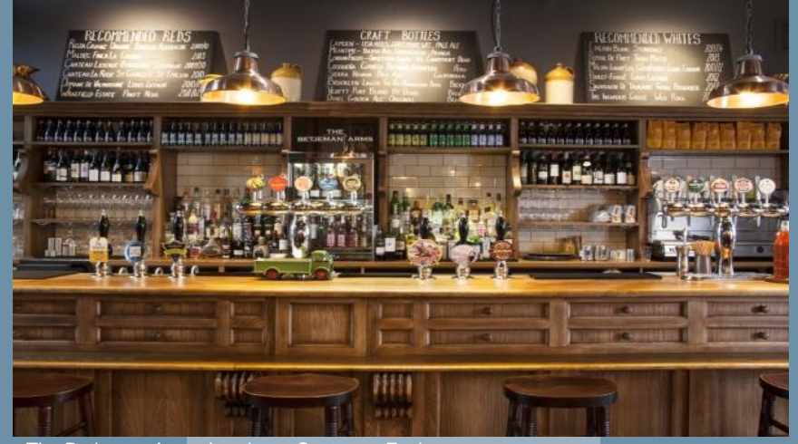
The Betjeman Arms, London – Customer Facing