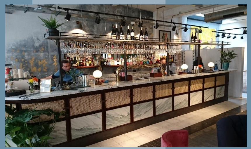
Scarlet Green, London - Customer Facing