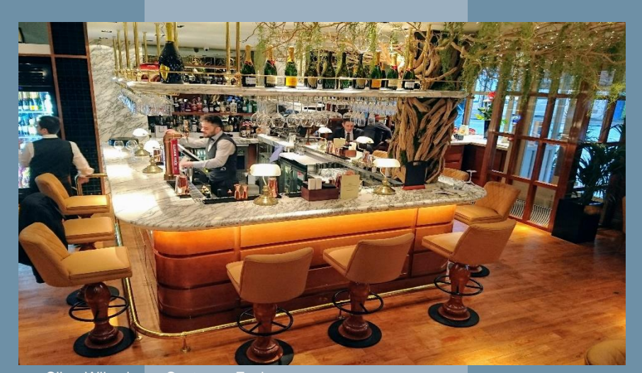
Cibo, Wilmslow – Customer Facing