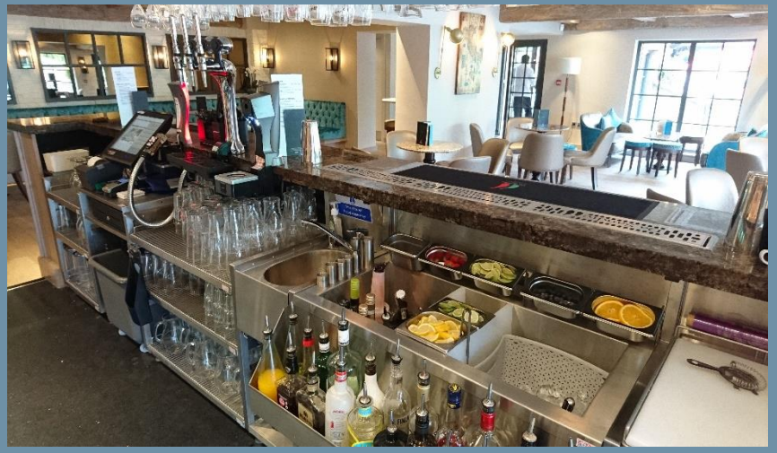
Da Sandro's Huddersfield – Back of Bar