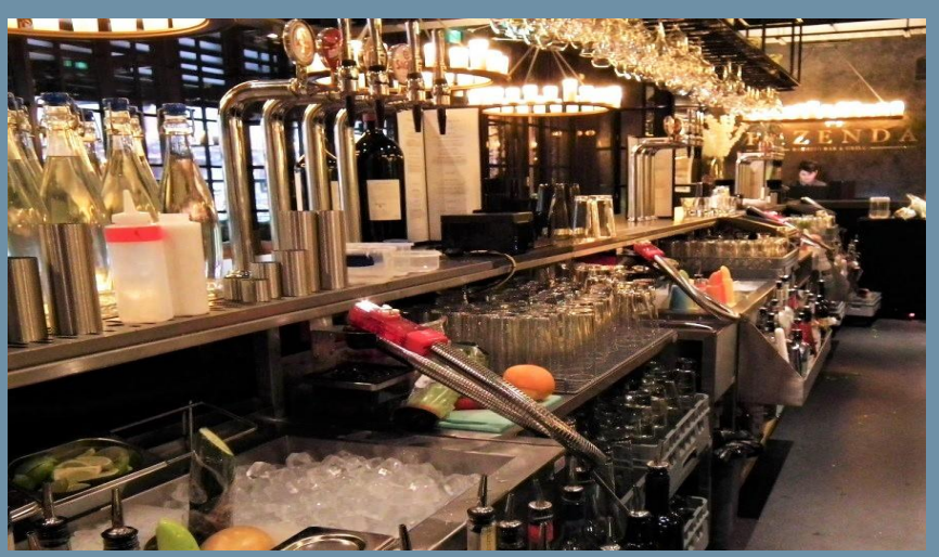
Fazenda, Manchester – Back of Bar