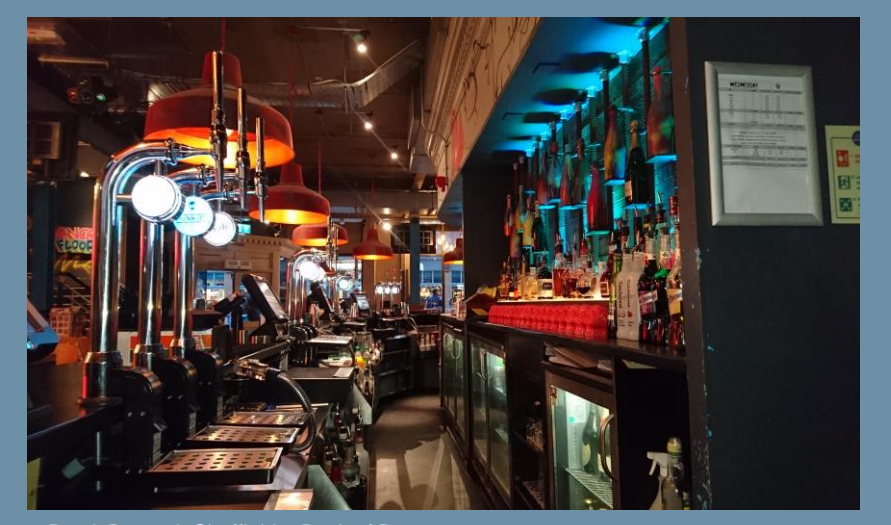
Bar & Beyond, Sheffield – Back of Bar