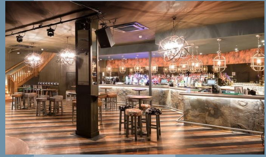
Venu, Pwllheli – Customer Facing