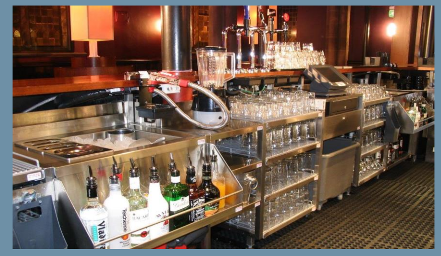
Halo, Leeds – Back of Bar