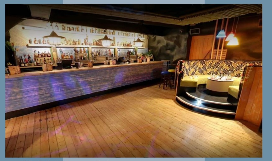
Atik, Oxford – Customer Facing