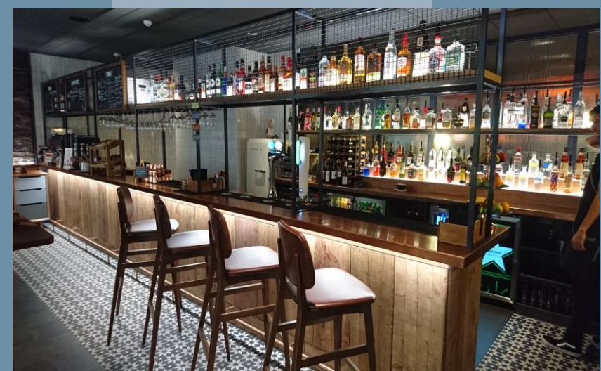
Ibis Hotel, Manchester - Customer Facing