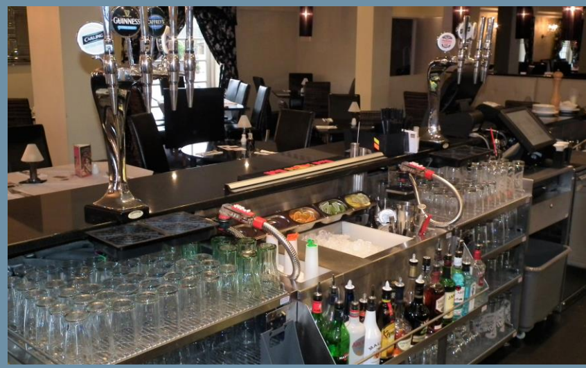
Hotel Van Dyk, Chesterfield – Back of Bar