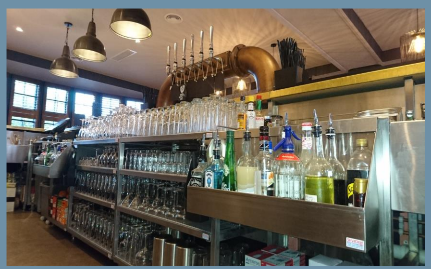
Hotel du Vin Avon Gorge, Bristol – Back of Bar