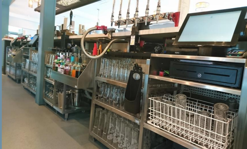
Sherdley Park Manor Golf Club, St Helens – Back of Bar