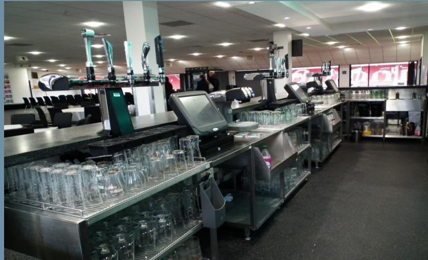
Stoke City Football Club, Stoke – Back of Bar