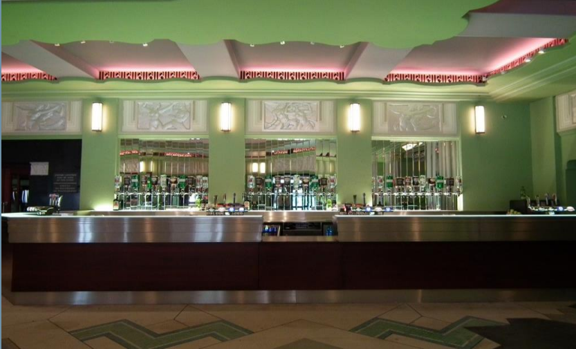
Hammersmith Apollo, London – Customer Facing