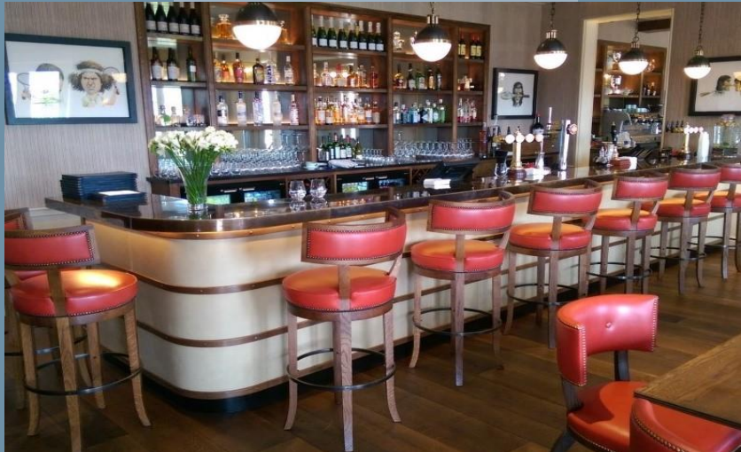
The Queens Club, London – Customer Facing