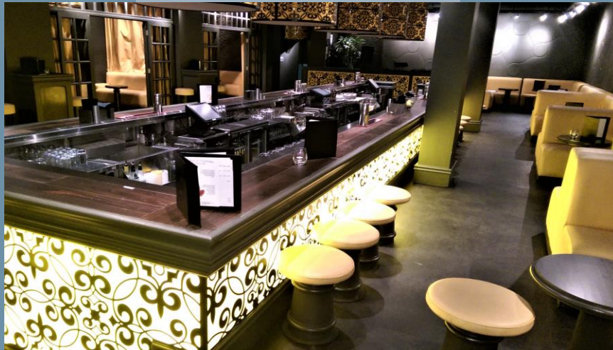
The Milton Club, Manchester – Customer Facing