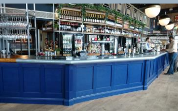
The Oyster Shed, London – Originally installed in 2011, first refit in 2015 and more recently 2018, using Servaclean Refit & Reuse Service