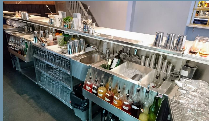
Cottonmouth, Nottingham – Back of Bar