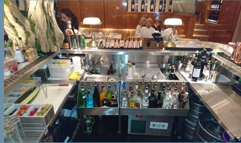
Cibo, Altrincham – Back of Bar