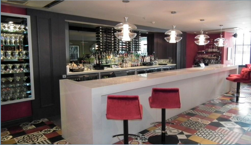
Nicholson's Bar (Hilton), Nottingham – Customer Facing