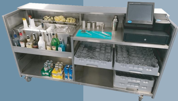
MOVERBar for Cocktails £3,990