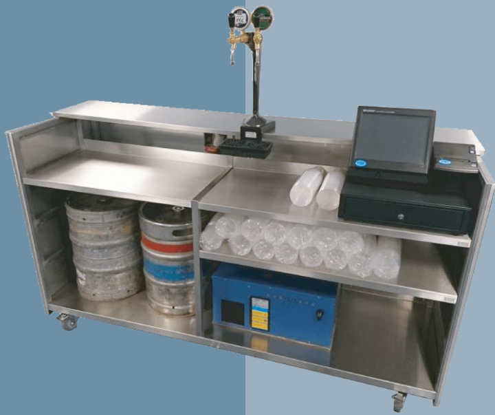
MOVERBar for Beer Dispense £2,990