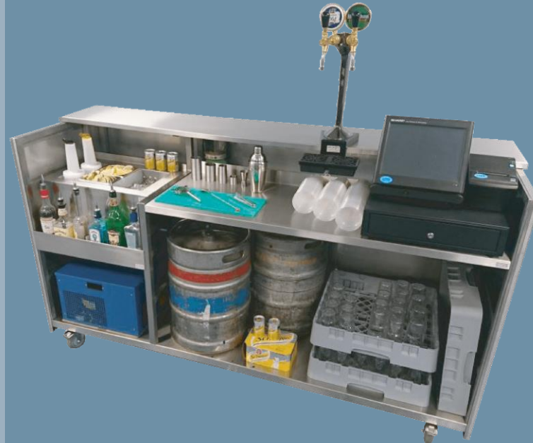
MOVERBar for Beer & Drinks Mixing £3,200 + VAT